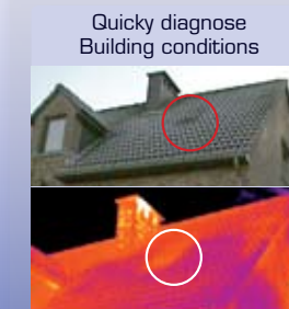
Quickly diagnose Building conditions The infrared inspection locates missing insulation in the roof. This can now be repaired and further energy loss prevented.