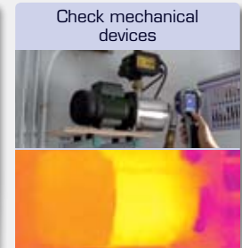
Check mechanical devices Inspection of this water pump shows no problem. The infrared image verifies that there is water in the pump cylinder and there is no danger of overheating the pump.